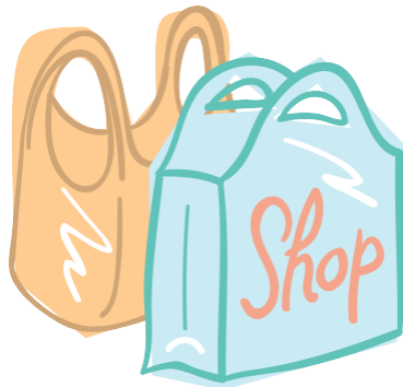
All Plastic Bags and Plastic Wrap