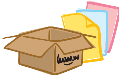
Paper and Cardboard